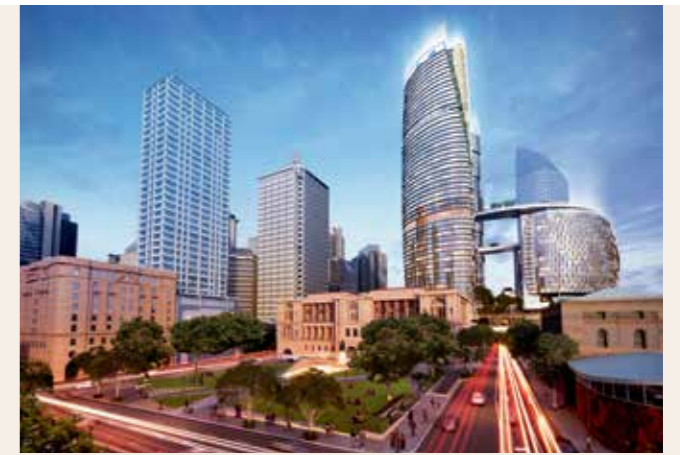
NEW RITZ-CARLTON (CONVERTED HERITAGE TREASURY BUILDING)

If successful, DBC will leverage Echo's position relocating the existing casino, negating the need for an additional casino licence. As international experience has shown, this approach will deliver a higher return on the investment in the precinct, enabling greater ongoing reinvestment by DBC in Brisbane and Queensland.