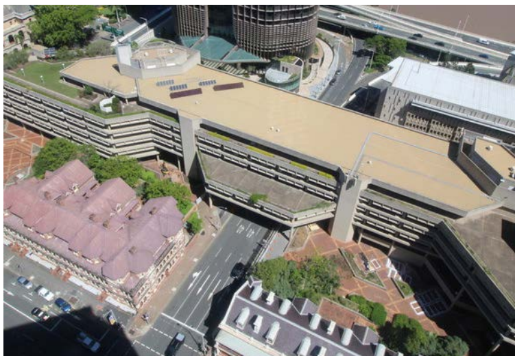
Image 1: Before - Margaret Street overpass early 2017, from George St