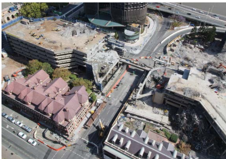
Image 2: After - Margaret Street overpass 17 September from George St