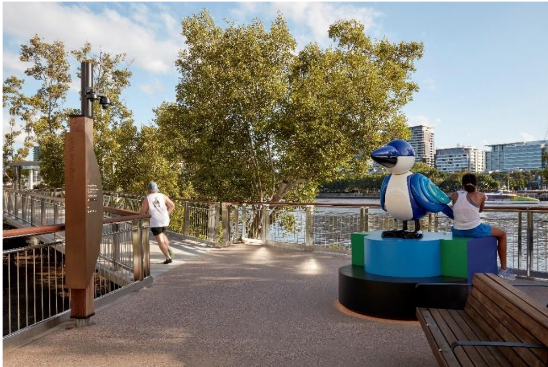
Image: Mangrove Walk