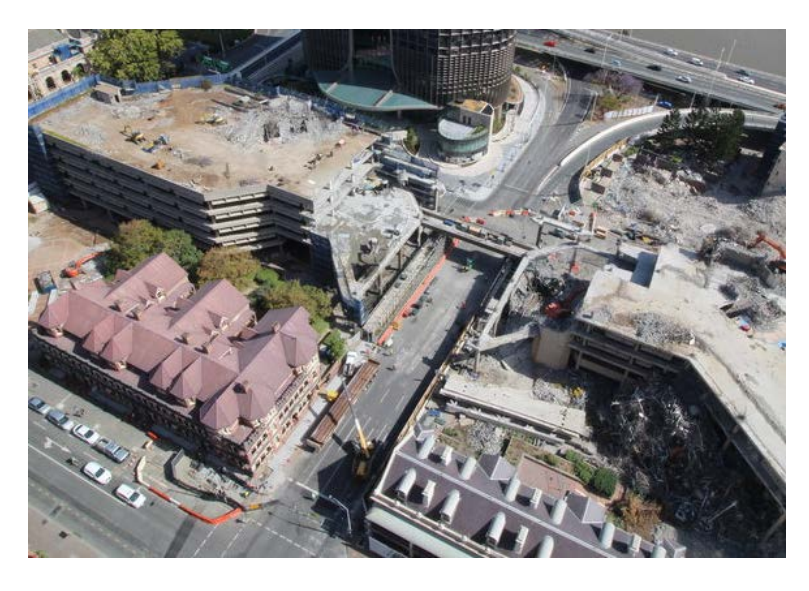
Image 2: After - Margaret Street overpass 17 September from George St