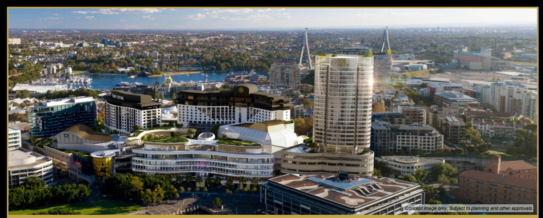
THE STAR SYDNEY – POTENTIAL NORTHERN TOWER EXPANSION*