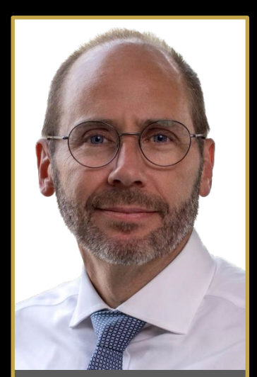
CHIEF RISK OFFICER