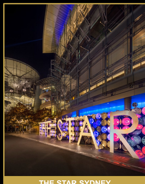
THE STAR SYDNEY