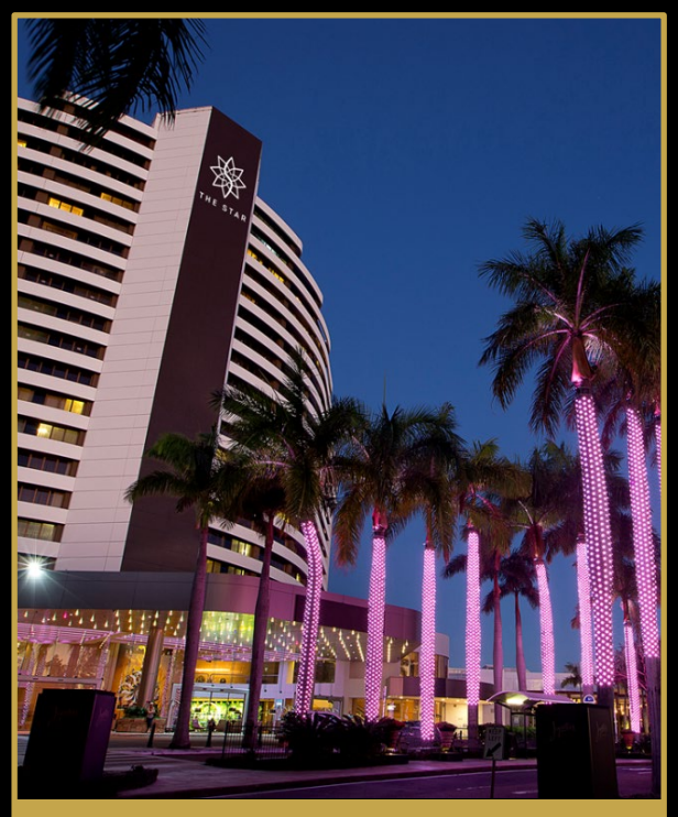
THE STAR GOLD COAST