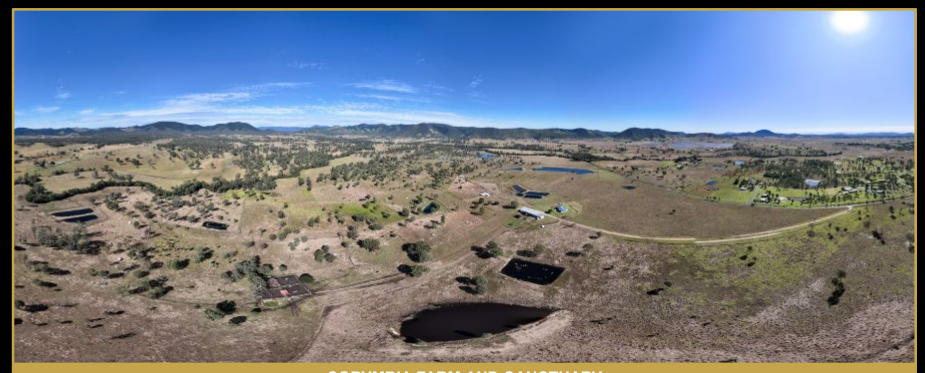
CORYMBIA FARM AND SANCTUARY